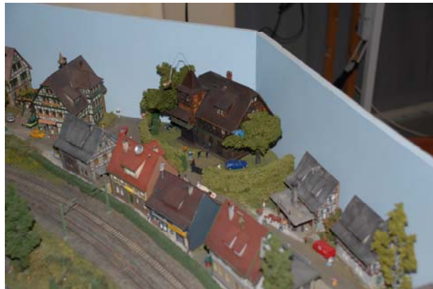
Harry Potter, look hard for the witch flying above house and car in tree.