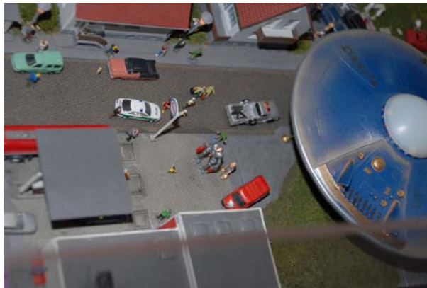
Alien getting gas.

Here are some more photos of modules from the N Trak Convention in Germany.