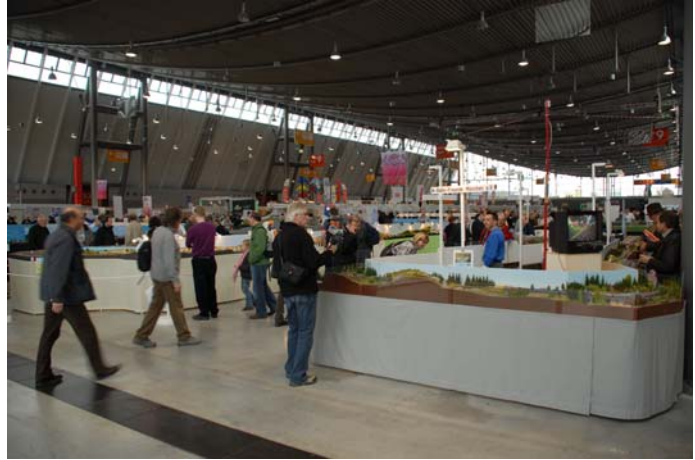
Scenes from the 4th International N Scale Convention held in Stuttgart Germany November 12th through 15th, 2009