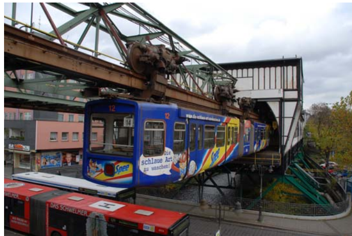
The suspended railway in Wuppertal.