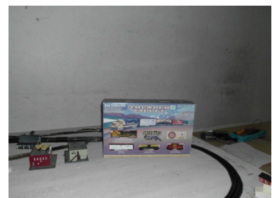
1st row l-r 1. Layout looking South, 2. Through the middle and 3. Looking North 2nd row 1. Coal train running on the layout 2. Justin and Eric talking trains 3 Same two 3 hours later 3rd row 1. Kevin talks with attendees 2. What's that hobo doing under that water tower 3. Raffle layout side view 4th row 1. Raffle layout long view 2. Semi aerial view 3 Raffle layout train set